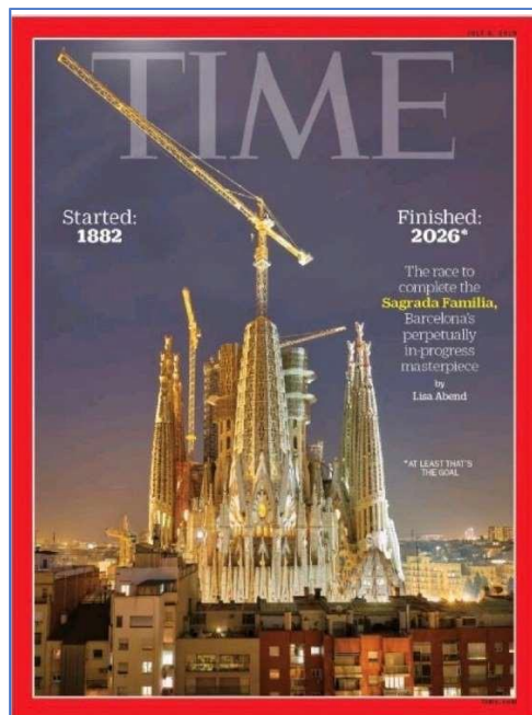
Figure 1. An unfinished Sagrada Familia with the last five central spiralling towers symbolizing the Four Evangelists and Jesus Christ in his Glory, and the Virgin Mary tower.

Although not finished, it is already a symbol of Barcelona (Figure 1). It is not surprising that the most international guide to the city, that of Robert Hughes, states that "the Holy Family is the emblem of the city, as the Eiffel Tower is for Paris or the Harbour Bridge for Sydney."