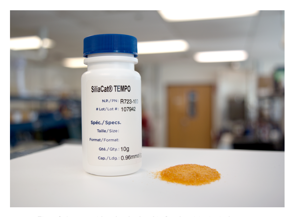
Figure 2. A commercial catalyst developed in Canada, originating in the context of Italy and Israel cooperation.

Prior to the signature of the intergovernmental agreement on industrial, science and technology collaboration signed on June 13, 2000, scientific collaboration between Italy and Israel relied on direct interaction between research centers and universities which exchanged PhD students or applied jointly to calls issued by public agencies and private foundations, and on bilateral agreement between Governments mostly enabling researcher exchange (in Italy the program was managed by the Research Council).